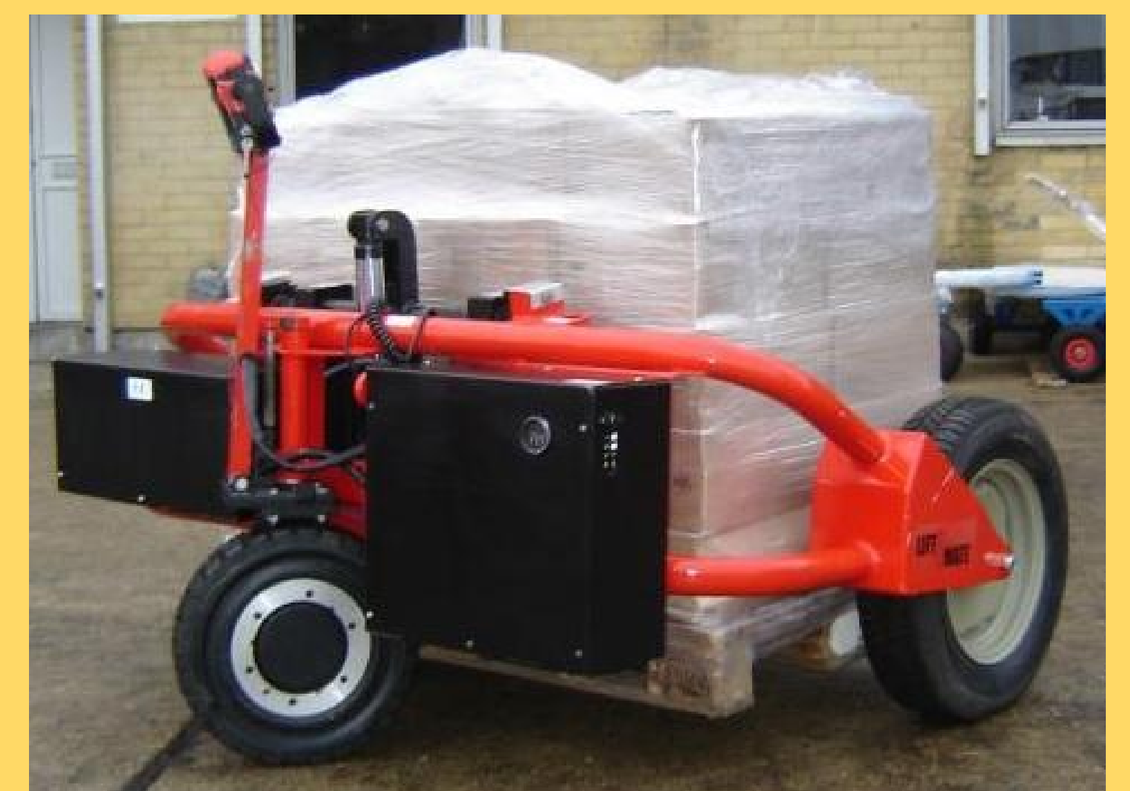
LiftMate Electric Rough Terrain Pallet Truck