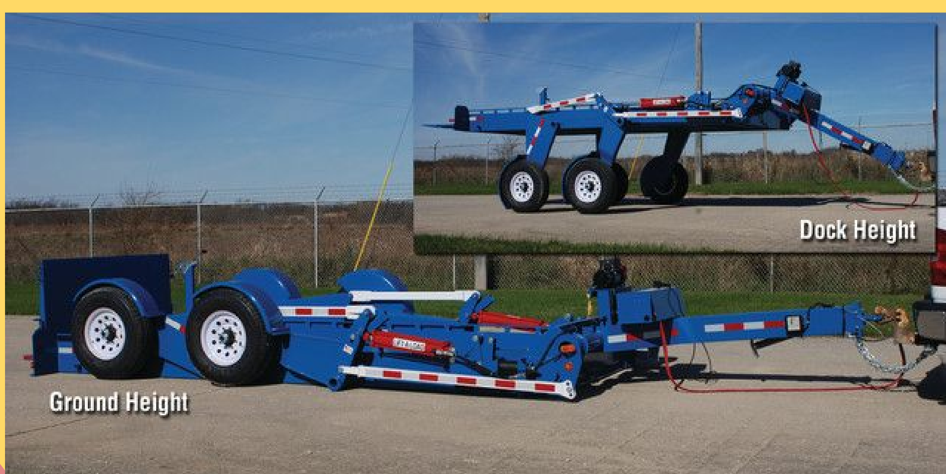
Advance Metalwork Lift-a-Load Trailer